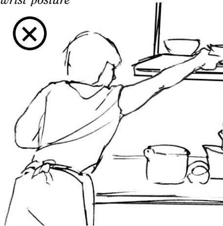
Example of awkward back, shoulder, and wrist posture